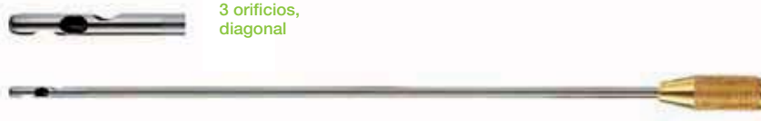
3 orificios, diagonal