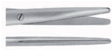
METZENBAUM 20,5 cm, 8"