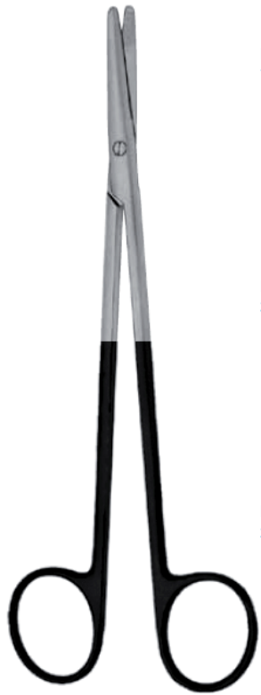
METZENBAUM 18 cm, 7"