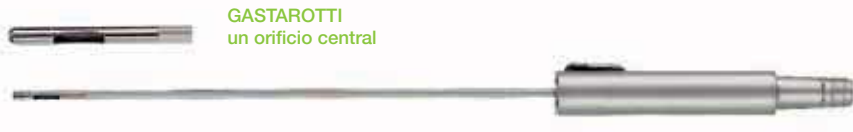
GASTAROTTI un orificio central