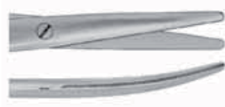
METZENBAUM 15,5 cm, 6"