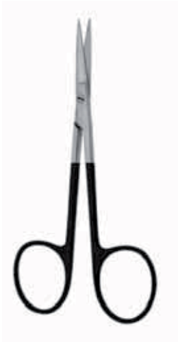
tijeras para indectomía 10,5 cm, 4 1/8"