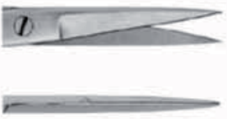
tijeras para indectomía 10,5 cm, 4 1/8"