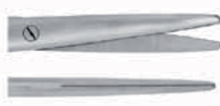
NELSON-METZENBAUM 26 cm, 10 1/4"