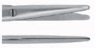
MAYO-STILLE 15 cm, 6"