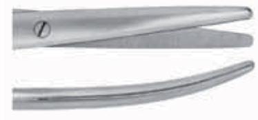
METZENBAUM 20,5 cm, 8"