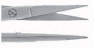
JABALEY 13 cm, 5 1/8"