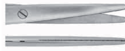
METZENBAUM 23 cm, 9"