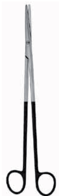
NELSON-METZENBAUM 26 cm, 10 1/4"