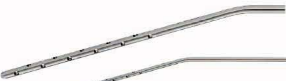
ENTNER 22 orificios