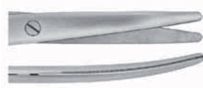
METZENBAUM 23 cm, 9"